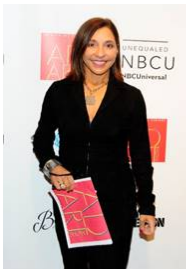
Linda Yaccarino