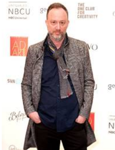
Jon Hamm