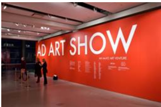
AD ART SHOW Red Carpet Wall