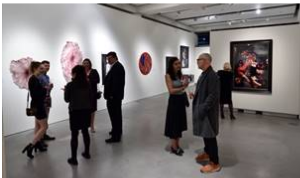
MvVO ART's AD ART SHOW at Sotheby's